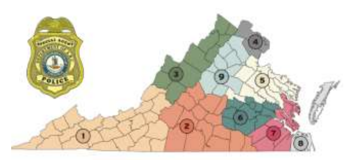
Region 8 - Chesapeake, Region 9 - Charlottesville

Region 1-Roanoke, Region 2-Lynchburg, Region 3-Stauanton, Region 4-Alexandria, Region 5-Fredericksburg, Region 6-Richmond, Region 7-Hampton,