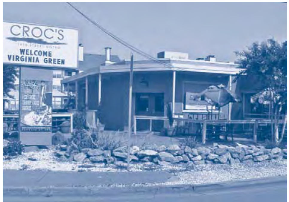
Croc's 19th Street Bistro was the first restaurant in Virginia to be certified as Virginia Green.

"It can be as simple as turning off the lights that are not being used and reducing waste," she said. "The steps we've taken have saved us money. In many cases the benefits are immediate."