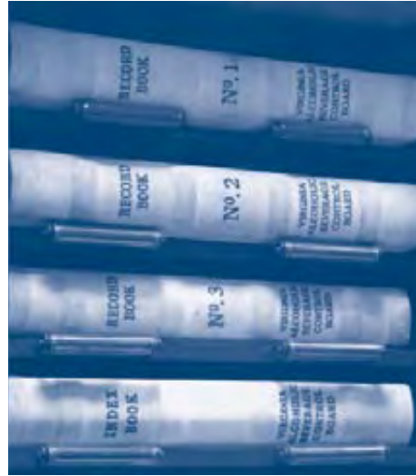
ABC's first record books (shown here) were among the records transferred to the Library.

beverage control system in 1934. These folks came in here and had to set up stores, warehouse, staff and regulations in a very short period of time. We tweak the system all the time, but we have 75 years of experience to build on. The pioneers came in after about 15 years of Prohibition and created an efficient, profitable and safe system." ♦