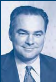
Governor Timothy M. Kaine

VIRGINIA DEPARTMENT OF ALCOHOLIC BEVERAGE CONTROL