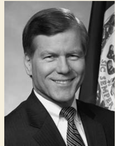
Governor Robert F. McDonnell