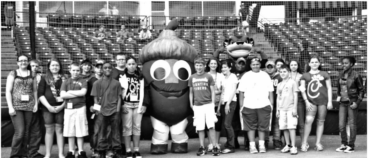
(Above) ABC honored the Middle School Poster Contest participants during the Flying Squirrels Education Day at The Diamond. Students are pictured with mascots Ginger and Nutzy.