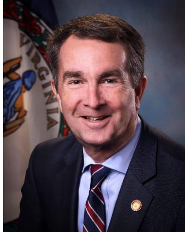
Governor Ralph S. Northam